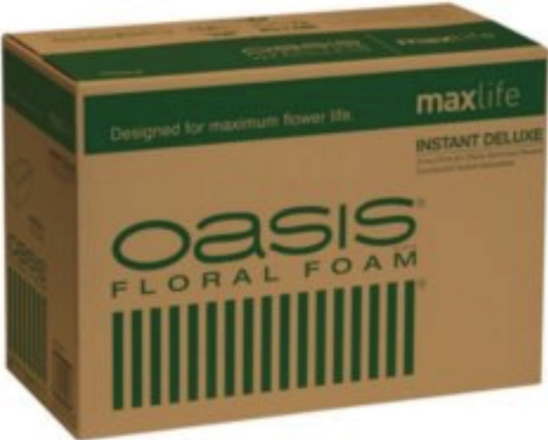
Oasis Instant Deluxe