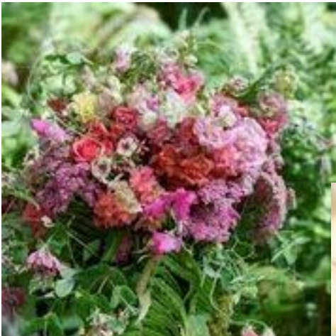
RASPBERRY HIGH NOTES