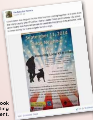
Pre-event Facebook post promoting the event.

“The publicity and attention were FREE and they made our presence known.”