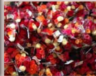
FTD donated 3,000 floral sleeves to The Daisy Fair Flowers for their event.