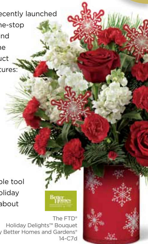
The FTD® Holiday Delights™ Bouquet by Better Homes and Gardens® 14-C7d

The features and functionality of the catalog make it a valuable tool to use during the upcoming holiday season to quickly find details about FTD arrangements.