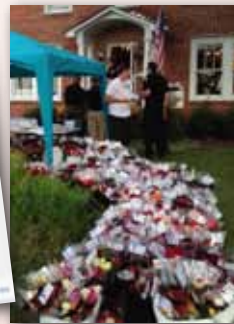
The Daisy Fair Flowers gave away more than 15,000 roses.

the local veterans charity to donate to and raised over $8,000.”