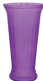
S. FROSTED LILAC GLASS VASE 5" dia. opening × 10½"H. $32.49 ctn. of 6 ($5.41 ea.) 20% OFF $25.99 ctn. of 6 ($4.33 ea.) JN FTG5037