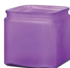
L. FROSTED LILAC GLASS CUBE 4¼" sq. opening × 4¾"H. $34.11 ctn. of 12 ($2.84 ea.) 20% OFF $27.29 ctn. of 12 ($2.27 ea.) JN FTG5038