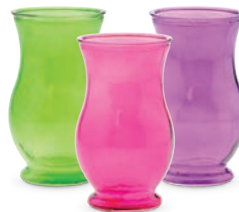
T. GLASS REGENCY VASES 3" dia. opening × 7"H. $25.59 ctn. of 9 ($2.84 ea.) 20% OFF $20.47 ctn. of 9 ($2.27 ea.) JN FTG9015