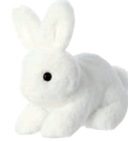
D. 8" PENNY BUNNY $25.81 ctn. of 4 ($6.45 ea.) JN 08913*