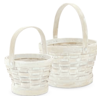
S. WHITEWASH WOODCHIP BASKETS Hard liners included. Moveable handle. 6" and 8" round. $60.88 ctn. of 12 ($5.07 ea.) 20% OFF $48.70 ctn. of 12 ($4.06 ea.) JN 856RDW