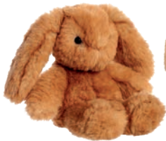
J. 9" SOFTIE BROWN BUNNY $35.20 ctn. of 6 ($5.87 ea.) JN 08968*