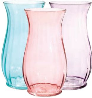
A. SPRING GLASS VASES 5½" dia. opening x 12"H. $63.96 ctn. of 3 ($21.32 ea.) JN 9740837