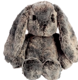
M. 12" NOVA BUNNY $35.20 ctn. of 4 ($8.80 ea.) JN 08944*