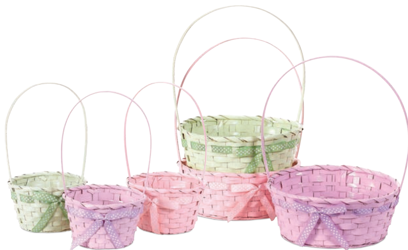
N. COTTON CANDY SPLITWOOD BASKETS Hard liners included. 6" dia. opening x 4"H. $88.20 ctn. of 24 ($3.68 ea.) JN 1-135C-1CC