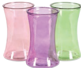
O. COLOR SPLASH GLASS GATHERING VASES 5" dia. opening × 8"H. $62.74 ctn. of 12 ($5.23 ea.) JN 7-899GLS-1SC