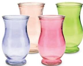
C. GLASS REGENCY VASES 3 3/4" dia. opening x 7"H. $25.88 ctn. of 12 ($2.16 ea.) 20% OFF $20.70 ctn. of 12 ($1.73 ea.) JN FGS1177