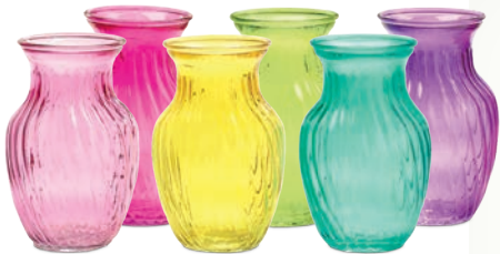
I. SWIRLED GLASS VASES 3" dia. opening x 7¾"H. $56.88 ctn. of 12 ($4.74 ea.) JN 9718063