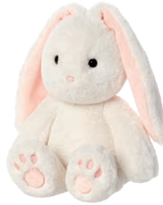
G. 12" PUDDING BUNNY $35.20 ctn. of 4 ($8.80 ea.) JN 08967*