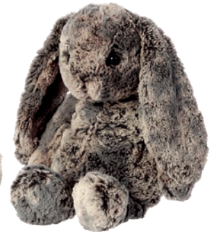
N. 15" NOVA BUNNY $23.47 ctn. of 2 ($11.73 ea.) JN 08945*

*$150 MINIMUM FOR PLUSH ITEMS · AVAILABLE IN CANADA