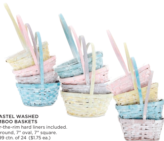
V. PASTEL WASHED BAMBOO BASKETS Over-the-rim hard liners included. 6½" round, 7" oval, 7" square. $41.99 ctn. of 24 ($1.75 ea.) 20% OFF $33.59 ctn. of 24 ($1.40 ea.) JN 1622GW