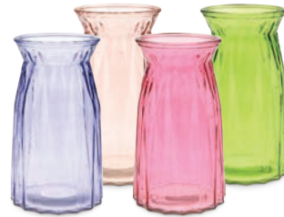
E. RIBBED GLASS VASES 3 1/2" dia. opening x 7 3/4"H. $37.88 ctn. of 12 ($3.16 ea.) 20% OFF $30.30 ctn. of 12 ($2.53 ea.) JN FGS1171