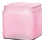
K. FROSTED STRAWBERRY SLUSH GLASS CUBE 4¼" sq. opening × 4¾"H. $34.11 ctn. of 12 ($2.84 ea.) 20% OFF $27.29 ctn. of 12 ($2.27 ea.) JN FTG2038