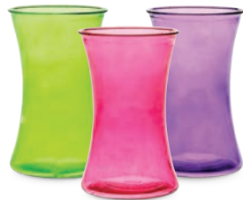
S. GLASS GATHERING VASES 3" dia. opening × 7¾"H. $19.63 ctn. of 6 ($3.27 ea.) 20% OFF $15.70 ctn. of 6 ($2.62 ea.) JN FTG2520