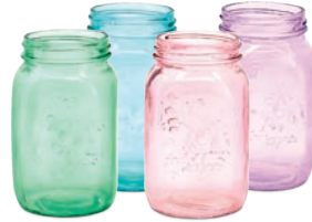
C. SPRING GLASS MASON JARS 2¾" dia. opening x 6½"H. $74.88 ctn. of 24 ($3.12 ea.) JN 9740843