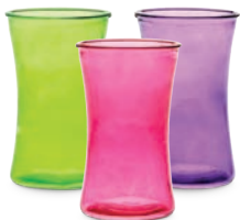
R. GLASS GATHERING VASES 3" dia. opening × 6½"H. $27.26 ctn. of 12 ($2.27 ea.) 20% OFF $21.81 ctn. of 12 ($1.82 ea.) JN FTG2522