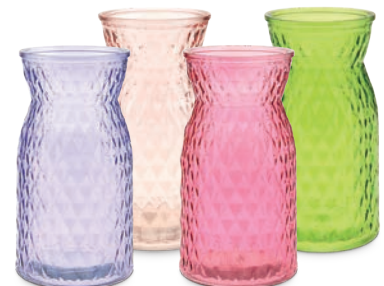
I. EMBOSSED GLASS VASES 4" dia. opening x 9 3/4"H. $45.88 ctn. of 8 ($5.74 ea.) 20% OFF $36.70 ctn. of 8 ($4.59 ea.) JN FGS1179