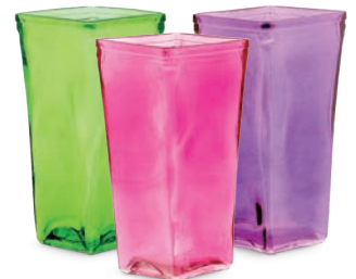
U. GLASS TAPERED VASES 3¾" sq. opening × 9"H. $21.88 ctn. of 6 ($3.65 ea.) 20% OFF $17.50 ctn. of 6 ($2.92 ea.) JN FTG936