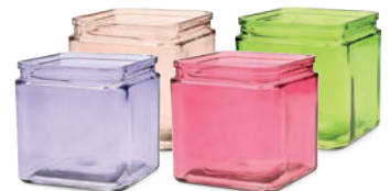
B. GLASS CUBES 4" sq. opening x 4 3/4"H. $32.88 ctn. of 12 ($2.74 ea.) 20% OFF $26.30 ctn. of 12 ($2.19 ea.) JN FGS1176