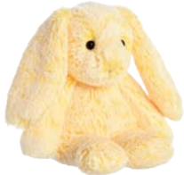
E. 9" YELLOW PADDLE BUNNY $35.20 ctn. of 6 ($5.87 ea.) JN 08951*