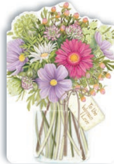
0530.83090 $3.75 To The Woman I Love You are incredible in so many ways, and I am so lucky to have you in my life. Wishing you a very Happy Mother's Day Glitter, Foil, Embossing, Die-Cut