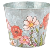
D. GALVANIZED METAL POTCOVER WITH FLORAL FLOURISH DESIGN PVC liners included. 6 3/4" dia. opening x 5 3/4"H. $48.00 ctn. of 12 ($4.00 ea.) JN 9740787