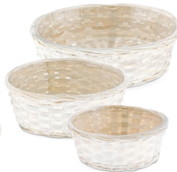
R. WHITEWASH BAMBOO DISHGARDENS Over-the-rim hard liners included. 8", 10" and 12" round. $61.37 ctn. of 24 ($2.56 ea.) 20% OFF $49.10 ctn. of 24 ($2.05 ea.) JN 1609GW