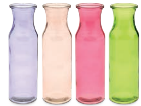
A. ENZO BUD VASES 1 1/4" dia. opening x 8"H. $16.88 ctn. of 12 ($1.41 ea.) 20% OFF $13.50 ctn. of 12 ($1.13 ea.) JN FGS1178