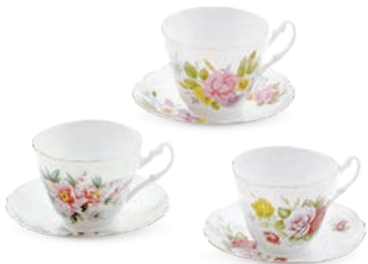
R. PORCELAIN ROSE TEACUP SETS 3" dia. cup; 5" dia. saucer. $54.88 ctn. of 24 ($2.29 ea.) 25% OFF $41.16 ctn. of 24 ($1.72 ea.) JN TCUP