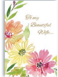
0530.83092 $3.75 On Mother's Day and always, thank you for everything. I love you. Foil