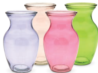
D. GLASS ROSE VASES 3 1/2" dia. opening x 8"H. $34.88 ctn. of 12 ($2.91 ea.) 20% OFF $27.90 ctn. of 12 ($2.33 ea.) JN FGS1175