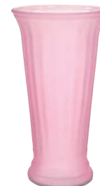
T. FROSTED STRAWBERRY SLUSH GLASS VASE 5" dia. opening × 10½"H. $32.49 ctn. of 6 ($5.41 ea.) 20% OFF $25.99 ctn. of 6 ($4.33 ea.) JN FTG2037