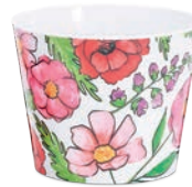
H. MELAMINE POTCOVER WITH FLORAL FLOURISH DESIGN 6 3/4" dia. opening x 5 3/4"H. $32.00 ctn. of 12 ($2.67 ea.) JN 2073304