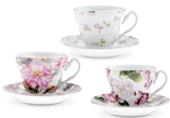
S. PORCELAIN TEACUP SETS 3¾" dia. cup; 5" dia. saucer. $39.26 ctn. of 12 ($3.27 ea.) 25% OFF $29.45 ctn. of 12 ($2.45 ea.) JN T550