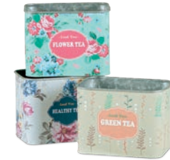
E. TEA TIME METAL PLANTERS Hard liners included. 5" x 3 1/4" opening x 4"H. $46.08 ctn. of 12 ($3.84 ea.) JN 6-067MT-1TT