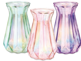
F. IRIDESCENT GLASS VASES 2" dia. opening x 7¼"H. $58.88 ctn. of 12 ($4.91 ea.) JN 9741056