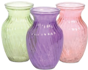
N. COLOR SPLASH GLASS SWIRLED VASES 4" dia. opening × 8"H. $49.37 ctn. of 12 ($4.11 ea.) JN 7-793GLS-1SC