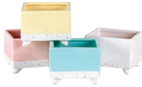
K. PASTEL CERAMIC PLANTERS 3¾" sq. opening × 3¼"H. $92.16 ctn. of 24 ($3.84 ea.) JN 4-342PTR-1APC