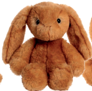
K. 13" SOFTIE BROWN BUNNY $32.85 ctn. of 4 ($8.21 ea.) JN 08969*