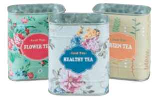
I. TEA TIME METAL PLANTERS Hard liners included. 5" x 3 1/4" opening x 6"H. $43.20 ctn. of 9 ($4.80 ea.) JN 6-068MT-1TT