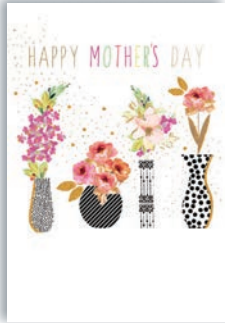
0530.83088 $3.75 With all of our love Glitter, Foil