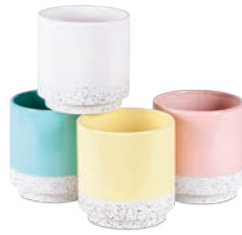
L. PASTEL CERAMIC PLANTERS 3½" dia. opening × 4¾"H. $46.08 ctn. of 12 ($3.84 ea.) JN 3-040PTR-1APC