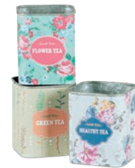
B. TEA TIME METAL PLANTERS Hard liners included. 3 1/4" sq. opening x 4 1/4"H. $39.36 ctn. of 12 ($3.28 ea.) JN 6-066MT-1TT