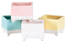
J. PASTEL CERAMIC PLANTERS 2¾" sq. opening × 2½"H. $100.80 ctn. of 36 ($2.80 ea.) JN 4-336PTR-1APC