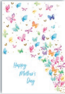
0530.83077 $3.75 The perfect time to celebrate how much you mean to me. Glitter, Foil