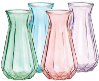
E. SPRING GLASS VASES 2½" dia. opening x 9½"H. $63.15 ctn. of 8 ($7.89 ea.) JN 9741206