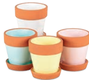
O. PASTEL CERAMIC PLANTERS Attached saucer. 2½" dia. opening × 3"H. $61.44 ctn. of 24 ($2.56 ea.) JN 3-225PTR-1APC