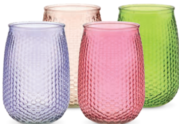
G. EMBOSSED GLASS VASES 4" dia. opening x 8"H. $42.88 ctn. of 12 ($3.57 ea.) 20% OFF $34.30 ctn. of 12 ($2.86 ea.) JN FGS1174