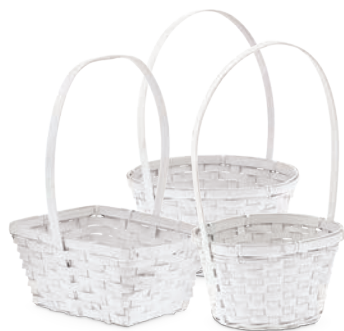
U. WHITE PAINTED BASKETS Hard liners included. 7" rectangle, 7" oval, 6½" round. $49.88 ctn. of 24 ($2.08 ea.) 20% OFF $39.90 ctn. of 24 ($1.66 ea.) JN 4112