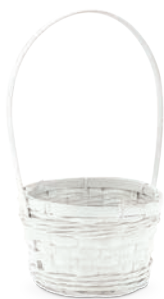
T. WHITE PAINTED BASKET Hard liners included. 6" dia. opening x 3¾"H. $67.99 ctn. of 24 ($2.83 ea.) 20% OFF $54.39 ctn. of 24 ($2.27 ea.) JN 5037GW