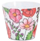
G. MELAMINE POTCOVER WITH FLORAL FLOURISH DESIGN 5" dia. opening x 4 1/2"H. $18.56 ctn. of 12 ($1.55 ea.) JN 2073303