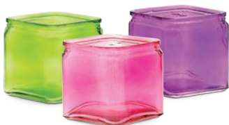
P. GLASS CUBES 4" sq. opening × 4¾"H. $25.88 ctn. of 9 ($2.88 ea.) 20% OFF $20.70 ctn. of 9 ($2.30 ea.) JN FTG925