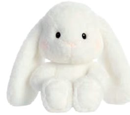
H. 9½" WHITE WILLA BUNNY $28.16 ctn. of 4 ($7.04 ea.) JN 08929*