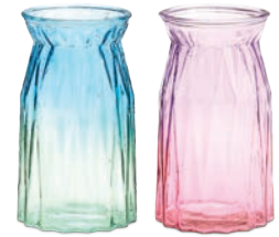
H. OMBRÉ GLASS VASES 3¾" dia. opening x 8"H. $63.68 ctn. of 12 ($5.31 ea.) JN 9740826