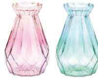
G. OMBRÉ GLASS VASES 2" dia. opening x 6"H. $79.36 ctn. of 24 ($3.31 ea.) JN 9740828