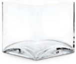
A. HANDBLOWN GLASS CUBE 5" sq. opening x 5"H. $28.88 ctn. of 6 ($4.81 ea.) 20% OFF $23.10 ctn. of 6 ($3.85 ea.) JN FTG555