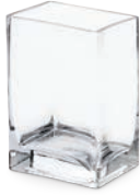
B. HANDBLOWN GLASS VASE 4" x 3" opening x 6"H. $26.34 ctn. of 6 ($4.39 ea.) 20% OFF $21.07 ctn. of 6 ($3.51 ea.) JN FTG346