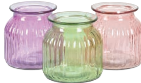
L. COLOR SPLASH GLASS GINGER VASES 4¾" dia. opening × 5¾"H. $60.69 ctn. of 12 ($5.06 ea.) JN 7-758GLS-1SC