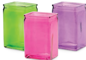
Q. GLASS VASES 4" × 3" opening × 6"H. $27.88 ctn. of 12 ($2.32 ea.) 20% OFF $22.30 ctn. of 12 ($1.86 ea.) JN FTG9016