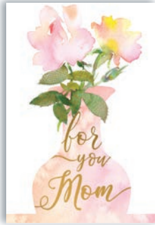
0530.83078 $3.75 May your day be as special as you are to me. Happy Mother's Day, with sincere thanks and love. Glitter, Foil