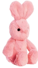
B. 9" PINK SPRINKLES BUNNY $25.81 ctn. of 4 ($6.45 ea.) JN 08965*