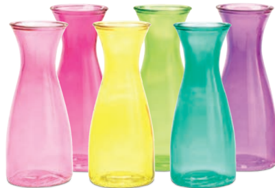
J. GLASS MILK BOTTLE VASES 2" dia. opening x 10"H. $56.48 ctn. of 12 ($4.71 ea.) JN 9718617