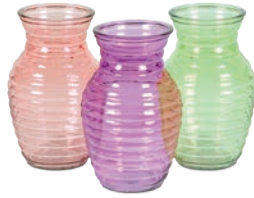
K. COLOR SPLASH GLASS RIBBED VASES 3½" dia. opening × 7¼"H. $29.83 ctn. of 12 ($2.49 ea.) JN 7-784GLS-1SC