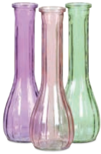
J. COLOR SPLASH GLASS BUD VASES 1½" dia. opening × 8½"H. $39.09 ctn. of 24 ($1.63 ea.) JN 7-829GLS-1SC