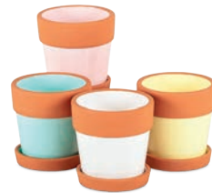
P. PASTEL CERAMIC PLANTERS Attached saucer. 3¼" dia. opening × 3¾"H. $103.68 ctn. of 24 ($4.32 ea.) JN 3-268PTR-1APC