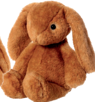
L. 16" SOFTIE BROWN BUNNY $21.12 ctn. of 2 ($10.56 ea.) JN 08970*