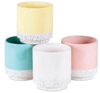
M. PASTEL CERAMIC PLANTERS 4¾" dia. opening × 5½"H. $67.20 ctn. of 12 ($5.60 ea.) JN 3-055PTR-1APC