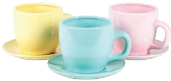
N. PASTEL CERAMIC CUP & SAUCER SETS 4" dia. opening × 4½"H; 7"OW. $35.04 ctn. of 6 ($5.84 ea.) JN 7-715PTR-1APC