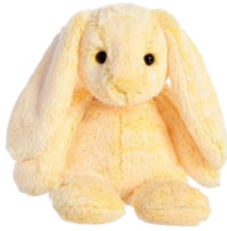
F. 12" YELLOW PADDLE BUNNY $35.20 ctn. of 4 ($8.80 ea.) JN 08952*