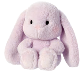
I. 9½" LAVENDER WILLA BUNNY $28.16 ctn. of 4 ($7.04 ea.) JN 08931*