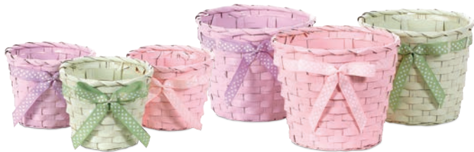
L. COTTON CANDY SPLITWOOD POTCOVERS Hard liners included. 4¾" dia. opening x 4½"H. $63.00 ctn. of 24 ($2.63 ea.) JN 3-169C-1CC