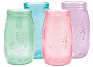
D. SPRING GLASS MASON JARS 3½" dia. opening x 8"H. $55.68 ctn. of 12 ($4.64 ea.) JN 9740649