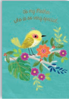
0530.83089 $3.75 To my Mother who is so very special... ..to me! Happy Mother's Day Glitter, Foil, Embossing