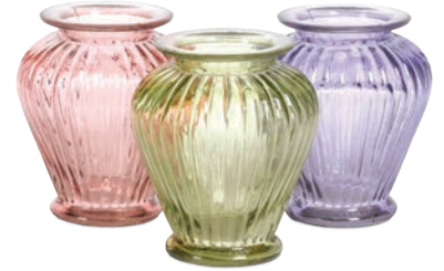
M. COLOR SPLASH GLASS GINGER VASES 5" dia. opening × 8"H. $63.26 ctn. of 9 ($7.03 ea.) JN 7-798GLS-1SC