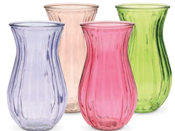
F. RIBBED GLASS VASES 4" dia. opening x 8 3/4"H. $38.88 ctn. of 12 ($3.24 ea.) 20% OFF $31.10 ctn. of 12 ($2.59 ea.) JN FGS1170