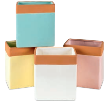
Q. PASTEL CERAMIC VASE 5" × 3¼" opening × 6"H. $53.12 ctn. of 8 ($6.64 ea.) JN 6-068PTR-1APC