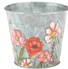
C. GALVANIZED METAL POTCOVER WITH FLORAL FLOURISH DESIGN PVC liners included. 5" dia. opening x 4 1/2"H. $36.32 ctn. of 12 ($3.03 ea.) JN 9740786