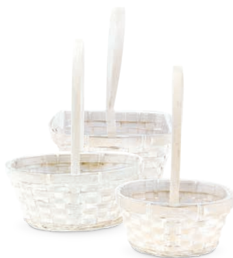
Q. WHITEWASH BAMBOO BASKETS Over the-rim hard liners included. 7" oval, 7" square, 6½" round. $40.88 ctn. of 24 ($1.70 ea.) 20% OFF $32.70 ctn. of 24 ($1.36 ea.) JN 1603GW