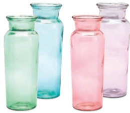
B. SPRING GLASS BUD VASES 1¾" dia. opening x 7¾"H. $62.72 ctn. of 24 ($2.61 ea.) JN 9740824