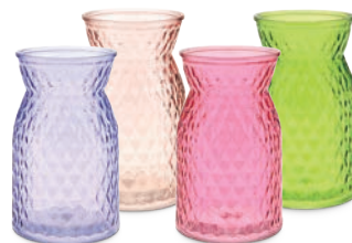
H. EMBOSSED GLASS VASES 3 3/4" dia. opening x 7"H. $34.88 ctn. of 12 ($2.91 ea.) 20% OFF $27.90 ctn. of 12 ($2.33 ea.) JN FGS1173