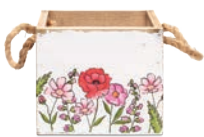
F. WOOD PLANTER WITH FLORAL FLOURISH DESIGN 5 1/4"W x 5 1/4"D x 4 1/2"H. $46.80 ctn. of 6 ($7.80 ea.) JN 9740776