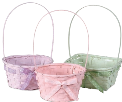
P. COTTON CANDY SPLITWOOD BASKETS Hard liners included. 7" oval, 6¼" round, 7" rectangle. $43.20 ctn. of 12 ($3.60 ea.) JN 1-603C-1CC