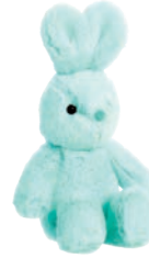
C. 9" GREEN SPRINKLES BUNNY $25.81 ctn. of 4 ($6.45 ea.) JN 08966*