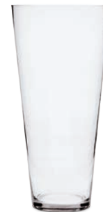
K. GLASS FRENCH VASE 5½" dia. opening x 12"H. $54.88 ctn. of 6 ($9.15 ea.) 20% OFF $43.90 ctn. of 6 ($7.32 ea.) JN G309