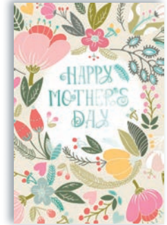
0530.83083 $3.75 You deserve nothing but the best. Enjoy your day! Glitter, Foil